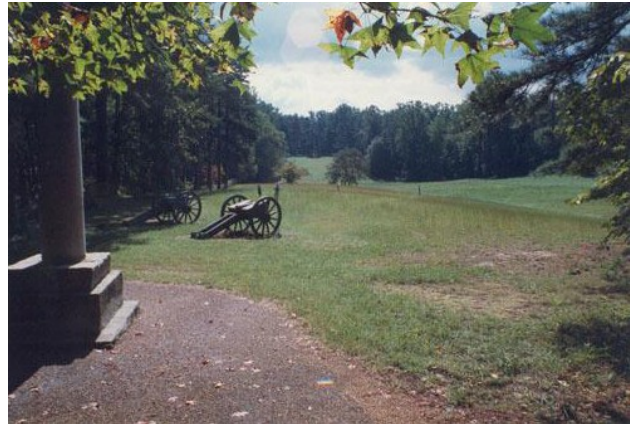
Site of Battle at Guilford Courthouse - in present-day Greensboro, NC