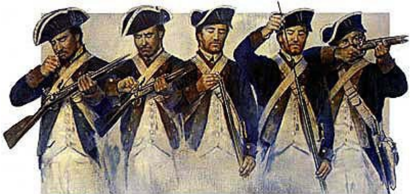
Continental Army soldier shown loading a rifle.