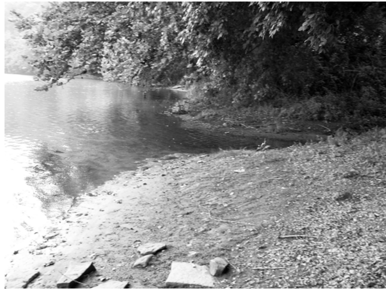
Spring that flows into the New River. Philip Lybrook had a mill on the spring branch near river. The children were playing near-by "on a rock located two hundred yards below the spring".

The three small boys were taken away and traveled thru woods for several days, I do not know how long. The Indians, only four in number, having ceased to watch them closely, and they having opportunity to converse with each other upon their situation, were led to determination to escape. They laid their plans which were acted on by two of them but failed with the other. Their plan was to lie down as usual at nite, but not to sleep, to be as quiet as if they were asleep, until they were sure that the Indians were sound asleep. They were then to get up and start on their long lonesome and perilous journey towards the east their only guide, the moon and stars, and can we help believing, the God who watches over the destinies of Nations, guided these little wanderers thru the wilderness in safety to their homes again?