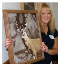
Winner of Bud Snidow painting.